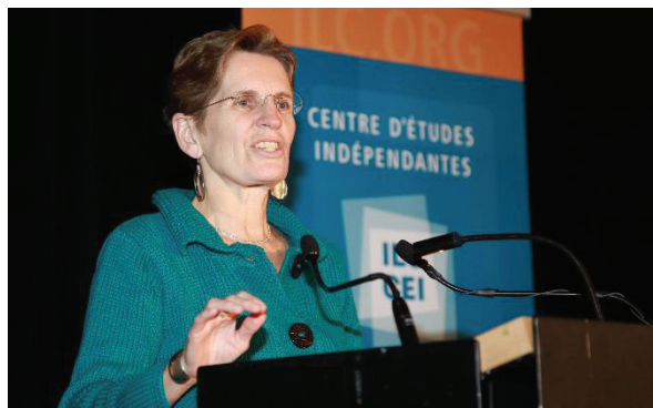
The Honourable Kathleen Wynne, addressing the 2009 graduating class.